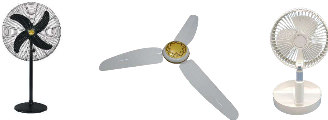
Figure 3: From left: Pedestal fan, ceiling fan, and table fan . Credits: Super Asia, Al-Ahmad, and Sun King . |

Ease of installation and use: Table and pedestal fans tend to be plug-and-play appliances. They may require minimal assembly that can be completed with simple household tools, such as screw drivers. Ceiling fans are more complex to install, as they require securely mounting the fan to a ceiling joist or bracket, which may need drilling, anchoring, and the use of a ladder, as well as electrical wiring. They require the customer or installer to have basic knowledge of electrical connections or the assistance of a qualified electrician.