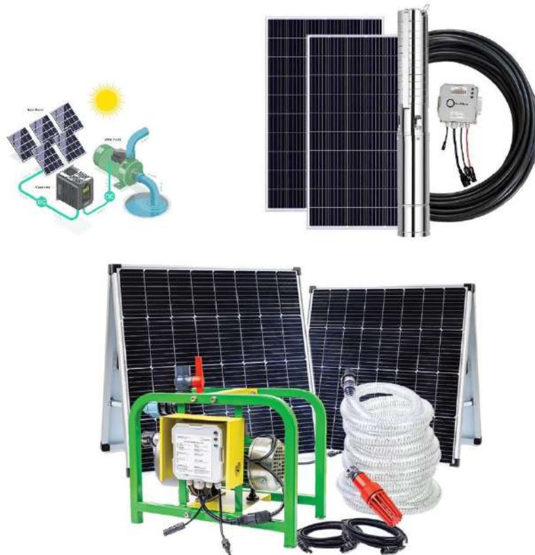
Figure 4: Solar water pumping appliances.