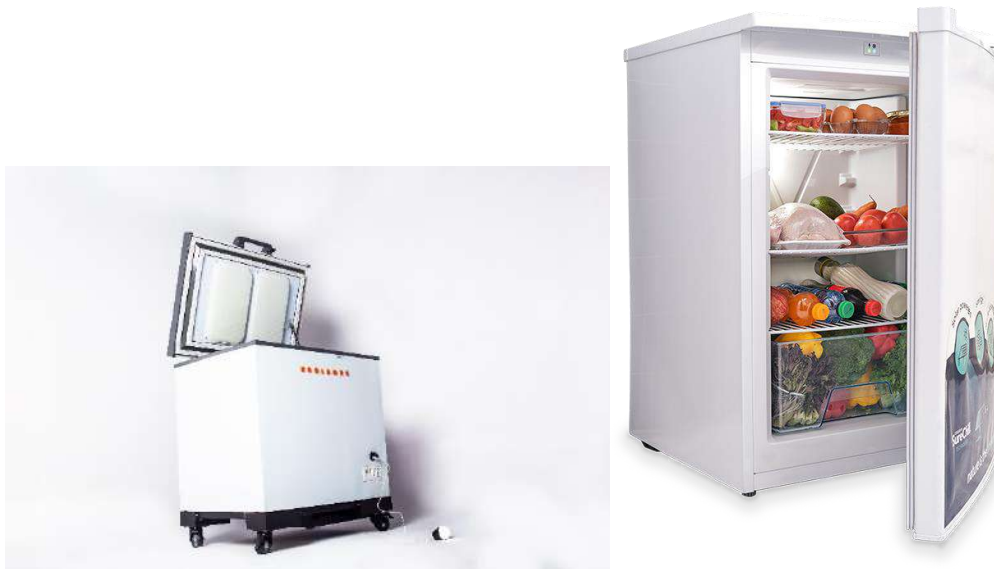
Figure 2: Refrigerating appliances

Ease of installation and use: It should be simple to set up and operate with minimal technical expertise.