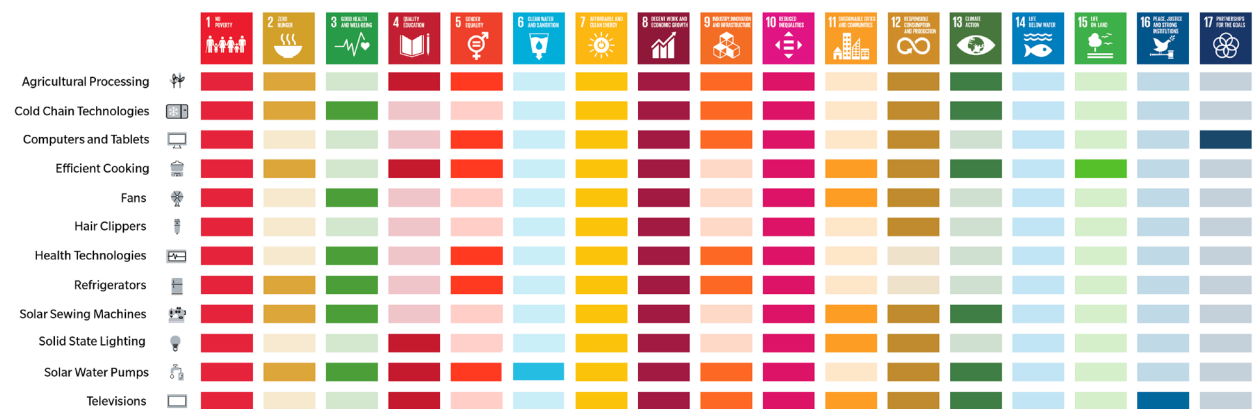
Figure 1. SDGs Impact by High-performing Appliances (Efficiency for Access Coalition)

High-Performing Appliances Help Achieve the UN Sustainable Development Goals