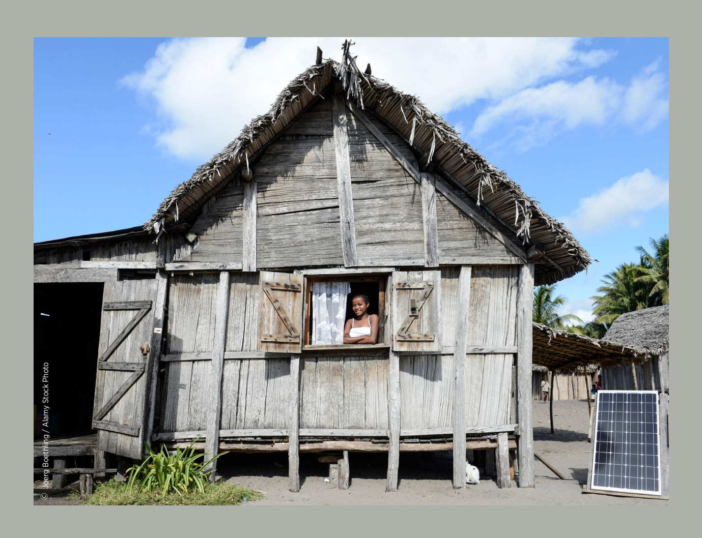
By providing greater service and cost-effectiveness, super-efficient, quality-assured appliances help off-grid clean energy reach more people.