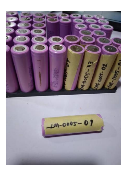
Figure 11: Dismantled cells stored in a battery holder