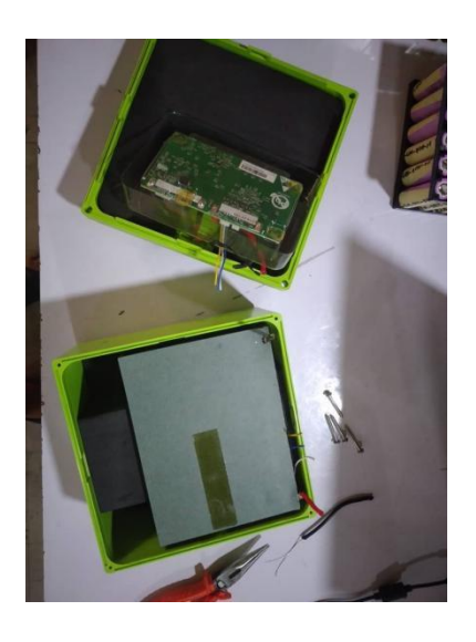
Figure 6: Top view of opened box with cut wires