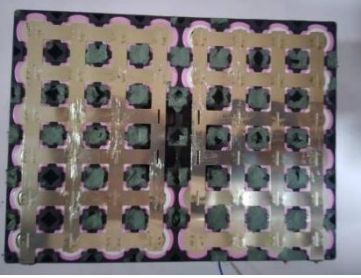
Figure 10: Top (left, 3 strip blocks) and bottom side(right, 2 strip blocks) connecting strips