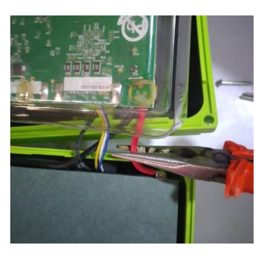
Figure 5: Cutting off the wire