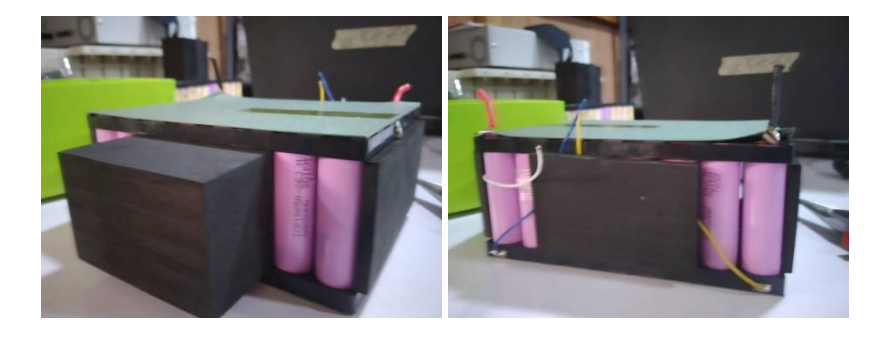
Figure 8: Battery module out of the container