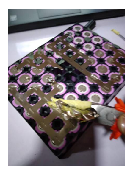
Figure 9: Stripping the connecting strip off with pliers which nose is tape-insulated