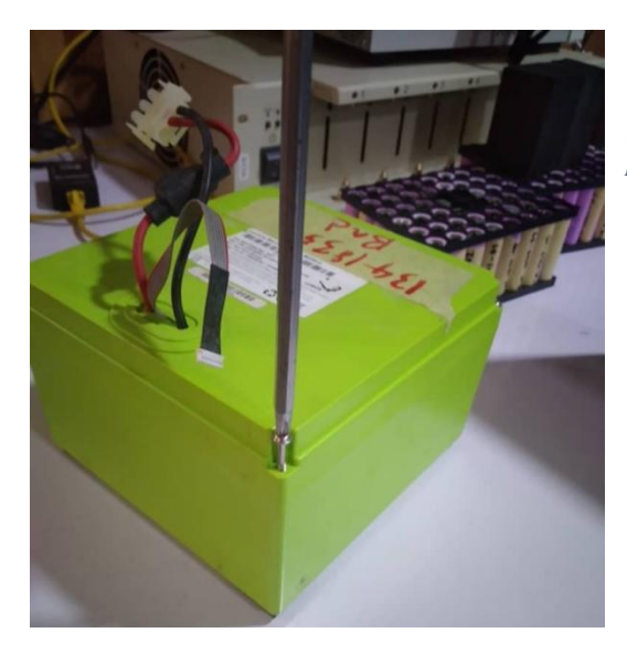
Figure 3: Lumos Battery pack