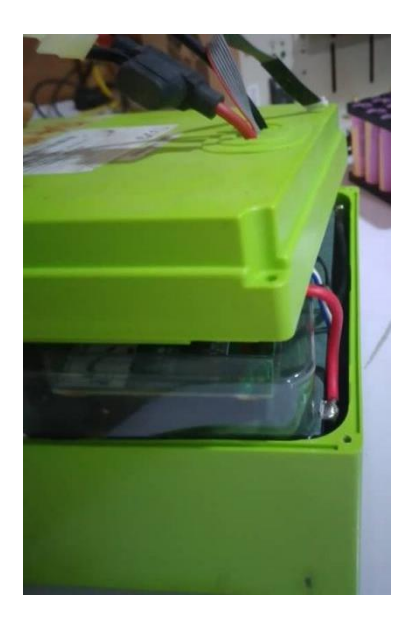
Figure 4: Slightly open the cover