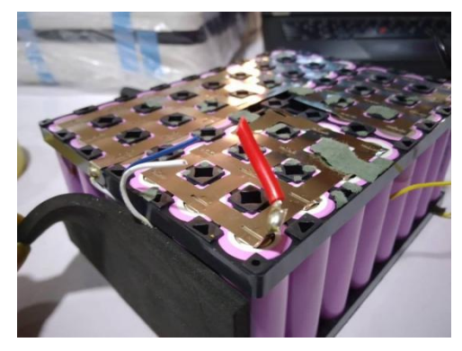
Figure 7: Removing the insulation and shock absorber foam