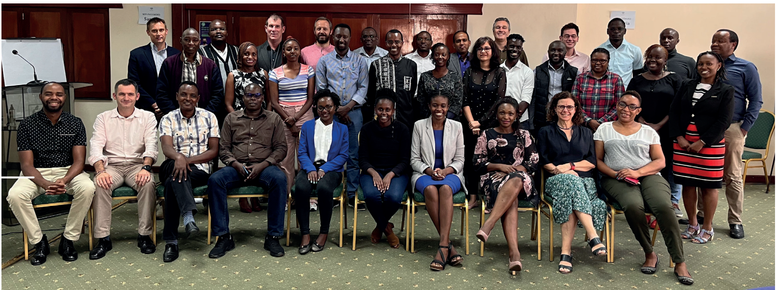
CAPTION: Stakeholders pose for a group photo after successfully concluding the Cold Chain Stakeholders Workshop on 27 May 2022 in Nairobi, Kenya.