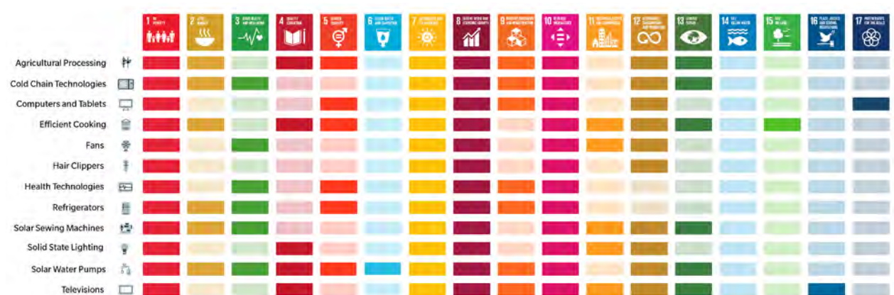
Figure 1. SDGs Impact by High-performing Appliances (Efficiency for Access Coalition)

High-Performing Appliances Help Achieve the UN Sustainable Development Goals